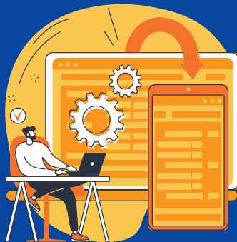
Excelling in Teaching and Learning