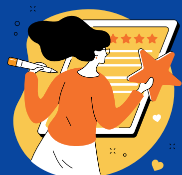
Building a Sustainable Community