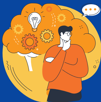
Advancing Student Success